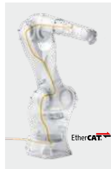
2nd arm User wiring option

A wide variety of devices and hands can be mounted on the robot flange with options for user wiring, piping, and solenoid valves. The 2nd arm user wiring allows up to two EtherCAT lines to be wired internally. The 3-axis wiring option prevents tangling and wear on the external wiring/piping.