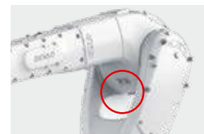
3-axis wiring option

A wide variety of devices and hands can be mounted on the robot flange with options for user wiring, piping, and solenoid valves. The 2nd arm user wiring allows up to two EtherCAT lines to be wired internally. The 3-axis wiring option prevents tangling and wear on the external wiring/piping.